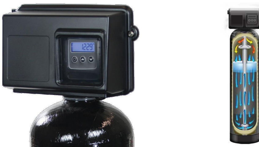
Fig 1 - AIO 2510 SXT Control Valve, Front View

A daily backwash will remove accumulated iron and replenish the filter media bed. The regeneration process also adds a fresh air pocket to the system.